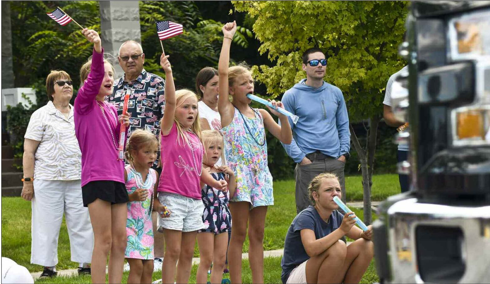
Parade-goers wave at a passing vehicle during the 2022 Swiss Days parade. This year's parade is scheduled for 4:30 p.m. Saturday.