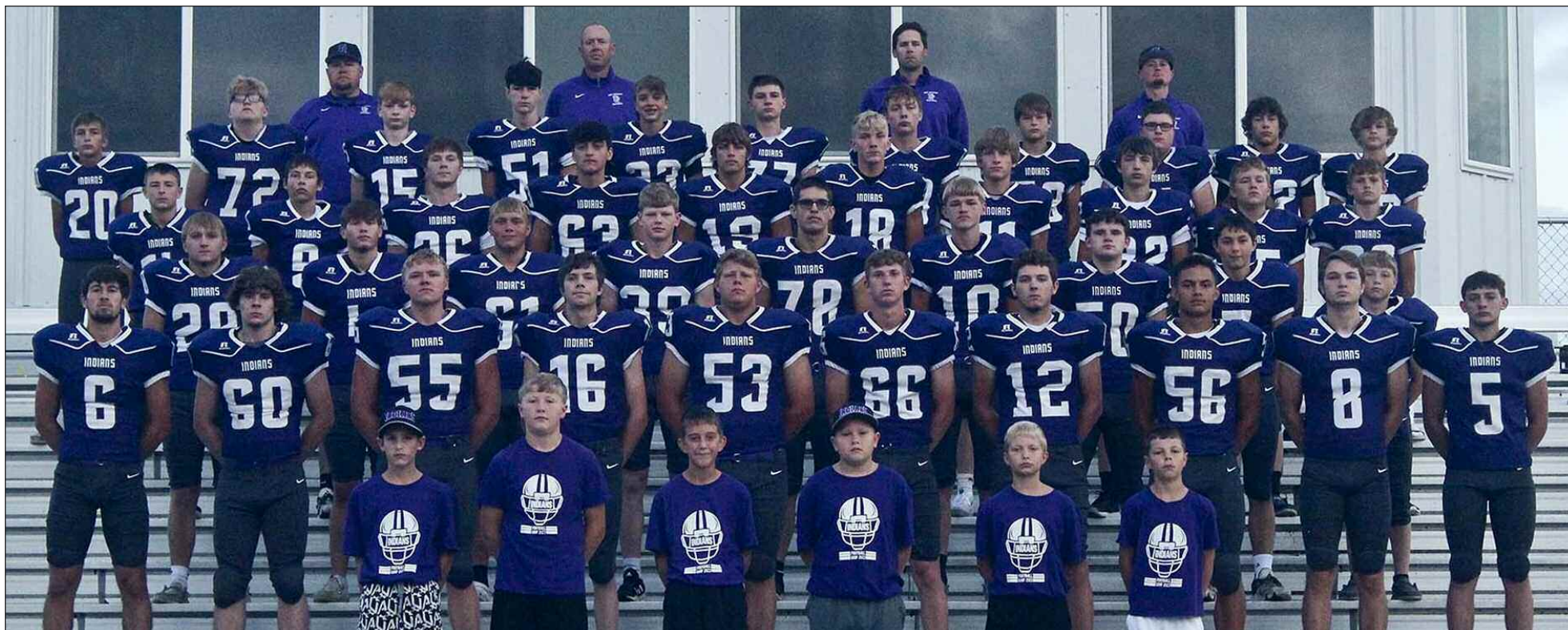
Pictured is the 2023 Fort Recovery High School football team. After going 3-8 last season, the Indians will open their season at Wayne-Trace on Aug. 18 before their home opener in week two against Urbana.